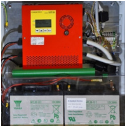
AT-M with 2 batteries NPL38-12i